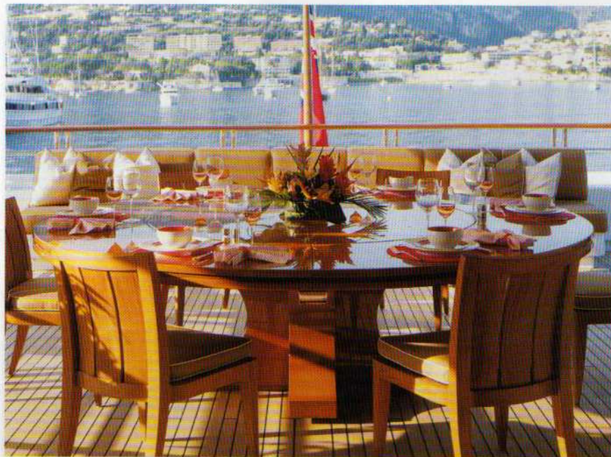
Left: the sunbathing area forward of the bridge becomes an open-air cinema or a delightful place to star gaze on clear nights. Above: splendid views accompany dining on the aft bridge deck Right: the ingenious tender launching system. Below: the gym and alfresco dining on the sundeck