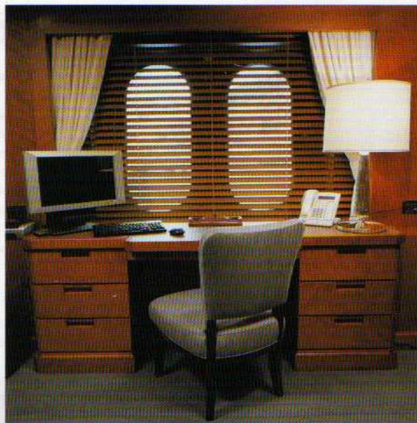
Left, above and below: the spacious, teak-lined bedroom in the owner's suite is accessed through an office and private sitting and television room Right: a marble-clad double shower and bath occupy the central area of the full-beam his-and-hers owner's bathroom