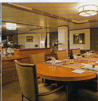
The main saloon (right) exudes comfort with plump, closely grouped seating, while the upper saloon (above) has a beach house feel. Casual dining on deck contrasts with more formal indoors (left, below)