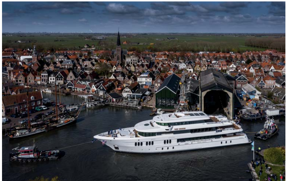
▲ Launch Top Five

Equally distinctive is Hakvoort's insistence on remaining fully custom in an industry increasingly driven by efficiency and repeat platforms. Every project begins without a template. "We are still a full custom shipyard, so we really start with a blank sheet of paper," Hakvoort says. Clients bring ideas, ambitions, and expectations, and the yard adapts around them rather than asking them to adapt to a preset design.