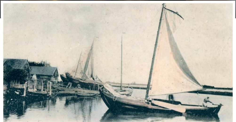
Hakvoort Shipyard before second world war ▲

and 20 meters. After the war, the boats grew larger and more capable, operating farther from home. By the 1970s, a 40-meter fishing trawler was considered substantial, particularly for vessels working across England, Scotland, Norway, and Denmark. These boats earned their keep in unforgiving conditions. “The North Sea can be one of the roughest seas in the world and fishermen, they don’t want to spend their days in a harbor with a vessel that’s broken,” Hakvoort says. Downtime was not an option.