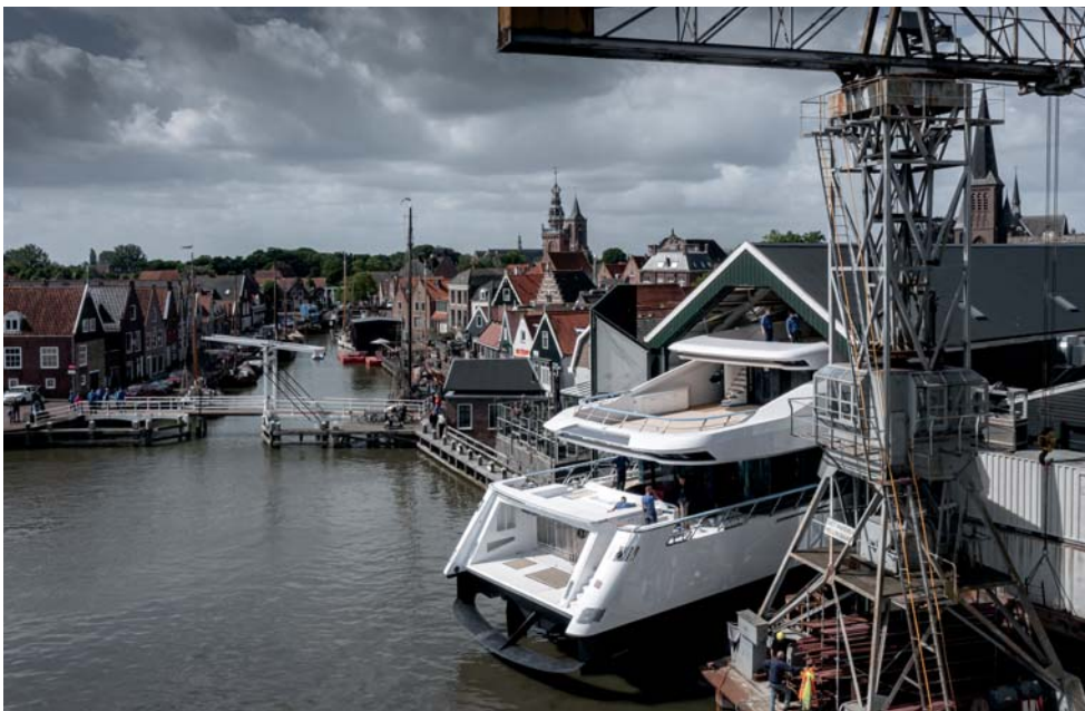
▲ Launch Adur

More than a century after its earliest boats were pulled from the water by hand, Hakvoort continues to operate with the same quiet confidence. Build it strong. Build it honestly. Build it to endure.